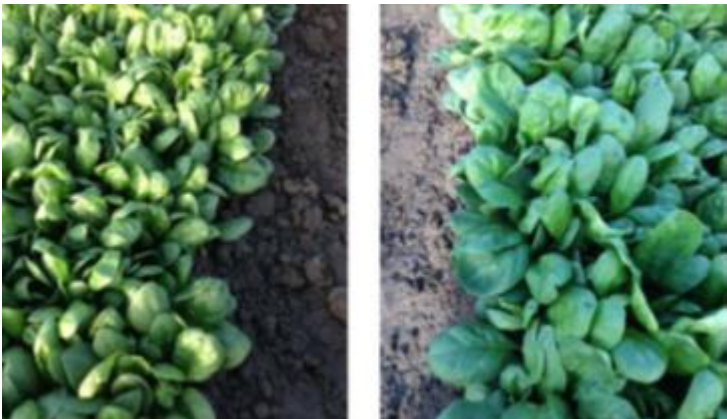
The image on the right shows baby spinach that was sprayed with CropBioLife and the image on the left shows the control plot