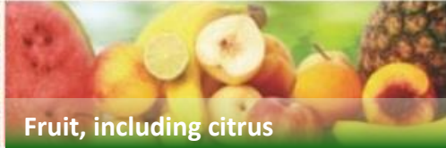
Fruit, including citrus